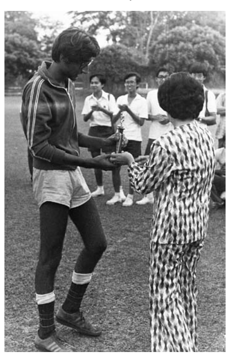
Celebrating achievements on the field.