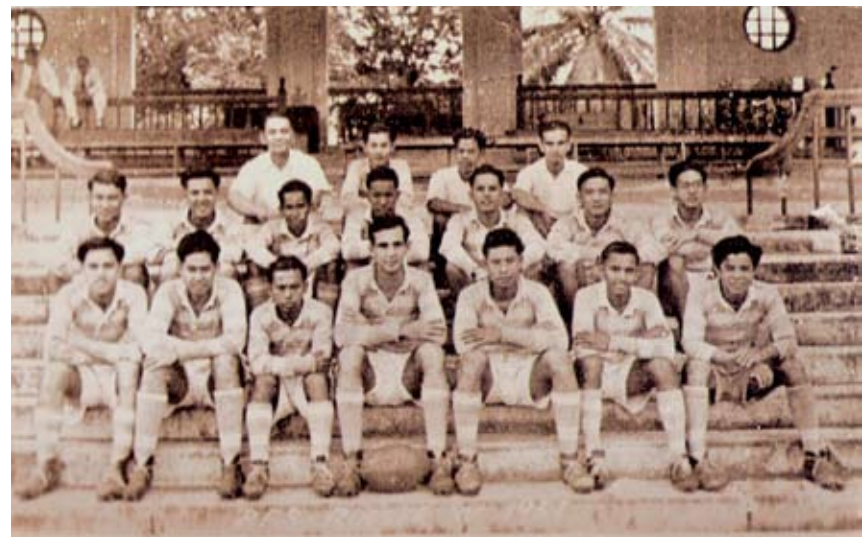
The PFS rugger team, 1951.