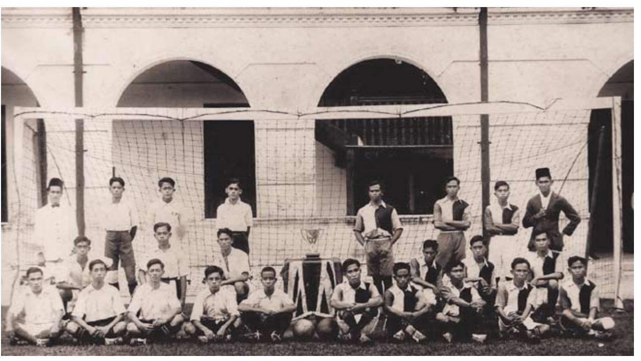
Membership in the PFS soccer team is coveted among students.