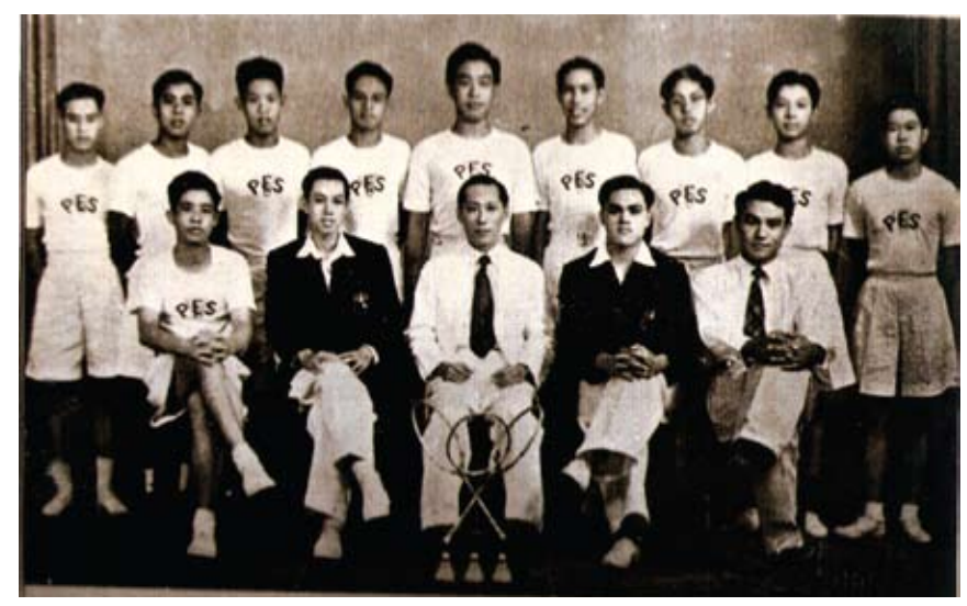
The PFS badminton team, 1952.